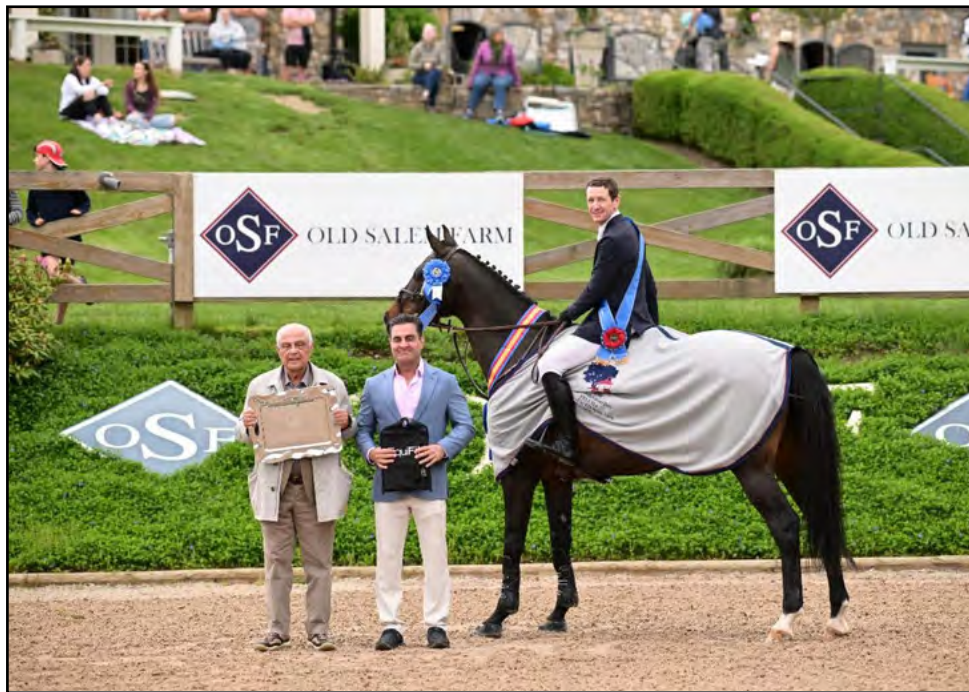
2025 Winner "Callas" and Mclain Ward

Please visit ryegate.com/uset.php Upcoming Classes to determine which classes will be included in the Rolex Computer Ranking List.