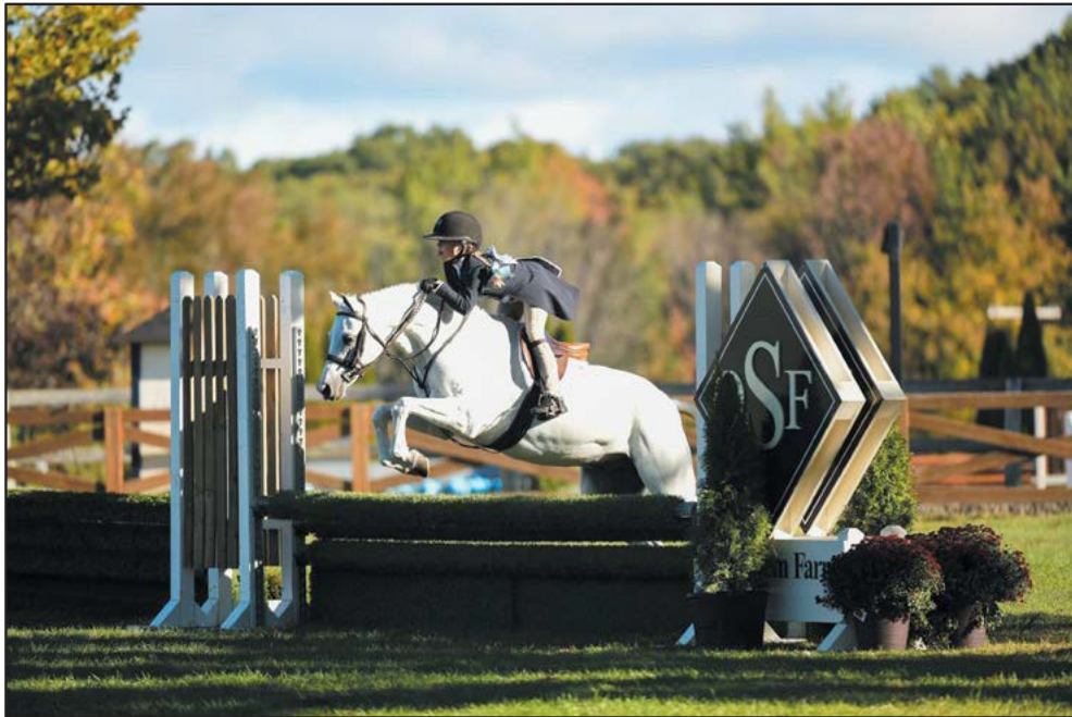
Fall Classic photo SEL Photography

Prize Money Awarded: $750 $550 $325 $200 $150 $125 $100 $75 $75 $50 $50 $50