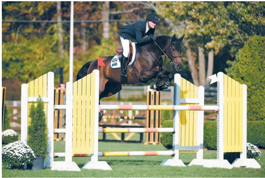
2023 $10,000 Old Salem Farm Jumper Classic

$3,000 $2,000 $1,000 $700 $600 $500 $450 $380 $380 $350 $320 $320