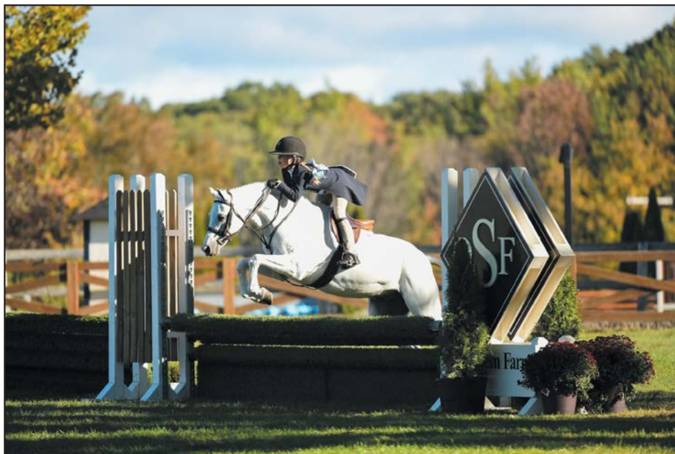
Fall Classic $1,500 Pony Hunter Derby

Prize Money Awarded: $750 $550 $325 $200 $150 $125 $100 $75 $75 $50 $50 $50