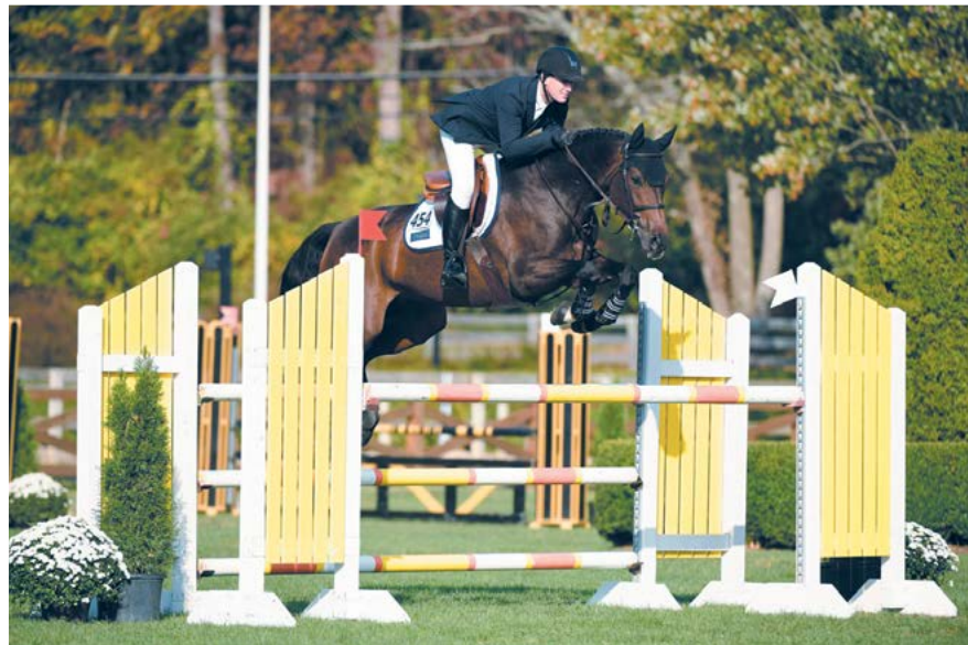
2023 $10,000 Old Salem Farm Jumper Classic

$9,000 $6,600 $3,900 $2,400 $1,800 $1,500 $1,200 $900 $900 $600 $600 $600